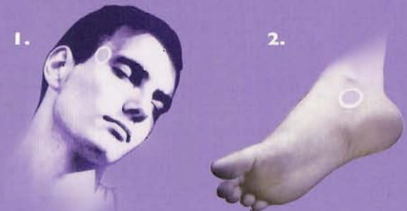
Fig.2 - Place the patch in the depression just below the ankle bone (the notch that sticks out) on the INSIDE RIGHT FOOT.